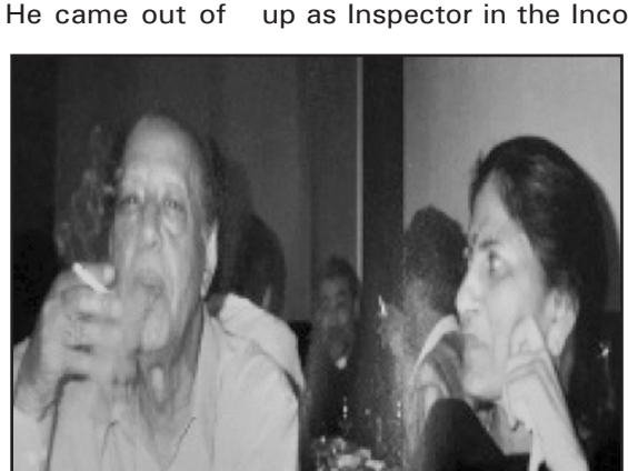
Sutta classic, the indulgence

the pernicious caste system, low position of the women in the society, rape of dalit girls, inadequacy of educational institutions, and the lack of hygiene etc. troubled him. He was unable to understand, why were there separate taps of drinking water at the Jullundur Railway station, one each marked for the Hindus, the Muslims and the for achhuts (untouchables).